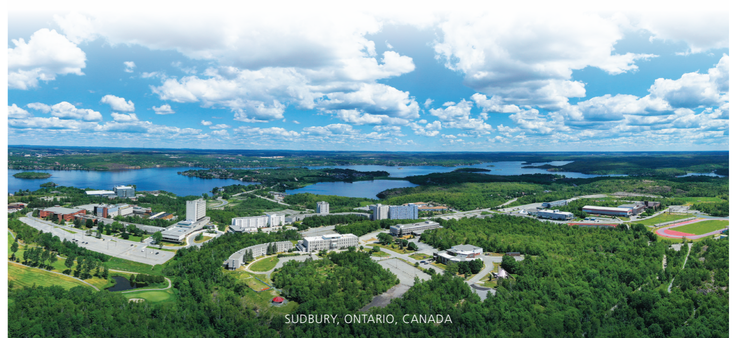
SUDBURY, ONTARIO, CANADA

Located in Sudbury (Canada) on 750 acres of pristine woodlands, Laurentian University is a public university, one of the two official bilingual universities in Ontario (English and French). Offering 113 programs at both the undergraduate and graduate levels of study, its post-graduation employment rate is among the highest in the province. With over 98% of its graduates getting meaningful and rewarding jobs within 2 years of completion, Laurentian University is a wise choice for postsecondary studies in Canada.